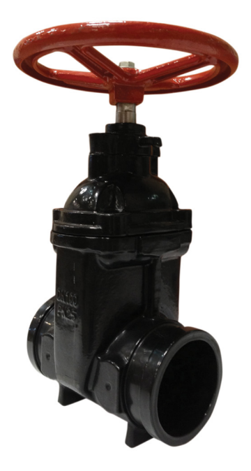
Series 7S2 Gate Valve